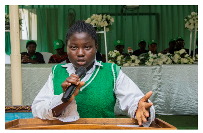
Plateau State Inter-school Debate finalist