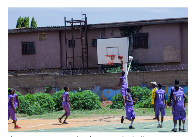
Plateau State Inter-School Boys Basketball Competition