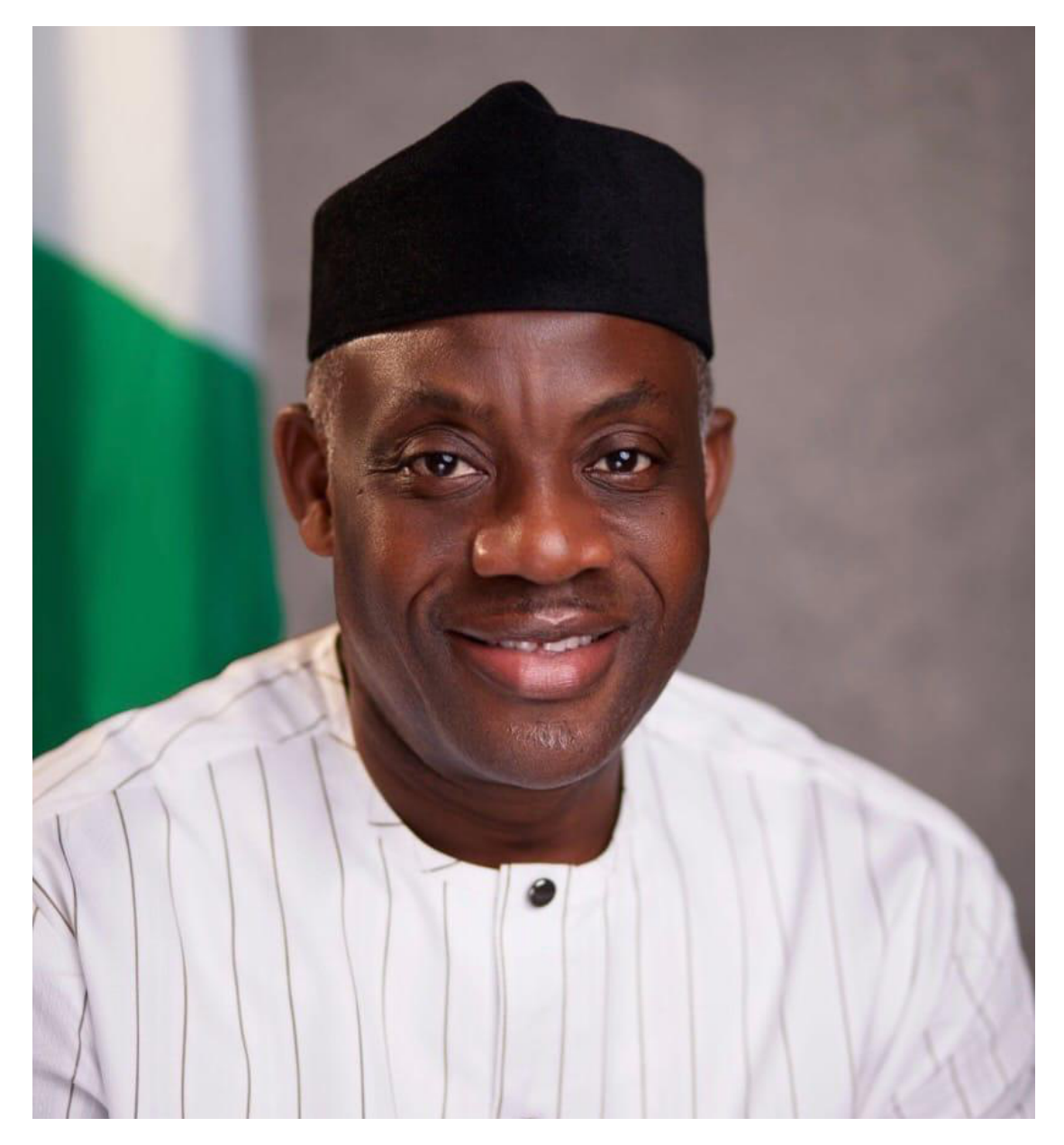
DR. TUNJI ALAUSA

MINISTER OF EDUCATION FEDERAL REPUBLIC OF NIGERIA