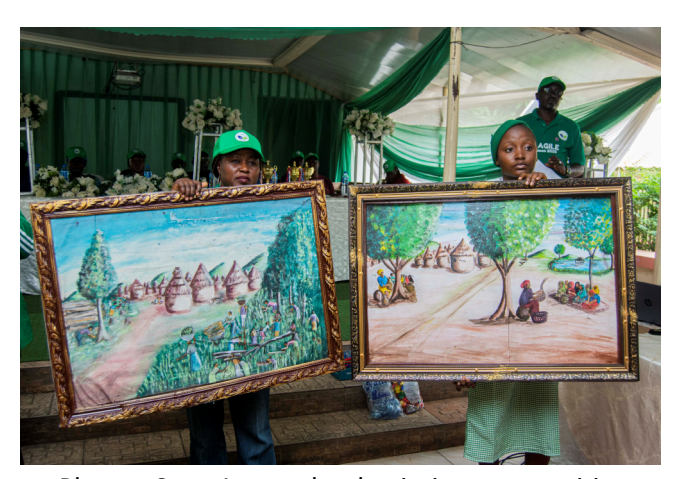
Plateau State Inter-school paintings competition