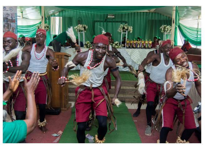
Plateau State Cultural Dance Troupe