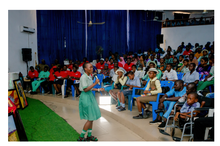
Ekiti State Inter-school Debate Final