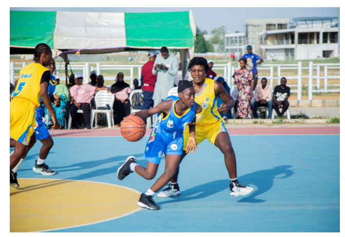
Kaduna State vs Borno State Girls Basketbal Competition